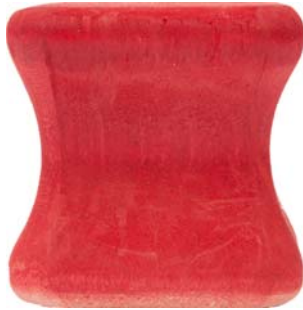
Ordnance (wooden block)